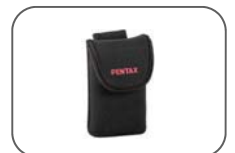
Black neoprene case