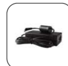
AC adapter kit