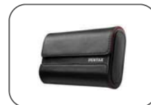
Black leather case